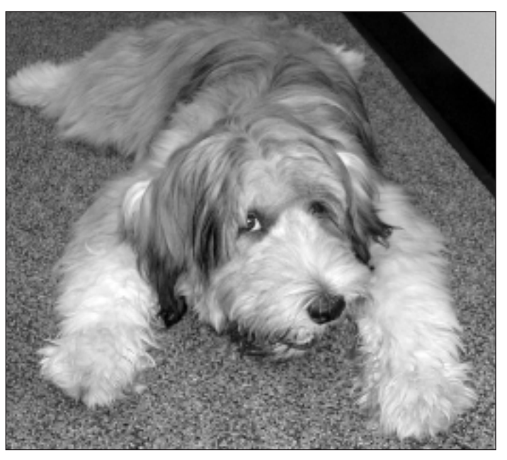
Radar relaxes between weather duties at Local 2

This quiet little fellow, covered with the softest fur and a fluffy face, came to the Houston Humane Society because his former owners understood that if they could not keep Radar, the Houston Humane