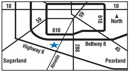
14700 Almeda Road, Houston, TX 77053

Please notice the sponsors and supporters throughout this newsletter that have helped us with our events and donated needed items. Patronize them as much as you can. Be sure to tell them you support them because they helped the homeless animals at the Houston Humane Society and you hope they will continue to do so.