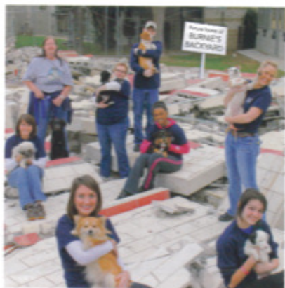
Burnie's Backyard before renovation

In memory of Burnie, Houston Humane Society's long-time mascot, the dog exercise and play area was completely renovated. As you can see from our cover, a quintessential modern-day dog park has been created exclusively for HHS resident animals to enrich their lives while they wait for their new families. It even boasts its own big red fire hydrant! Trainers and volunteers work with canines to improve their behavior and manners in hopes of increasing their chance for a successful adoption.