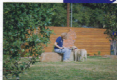
Burnie's Backyard photos courtesy of Tam Vo Photography.