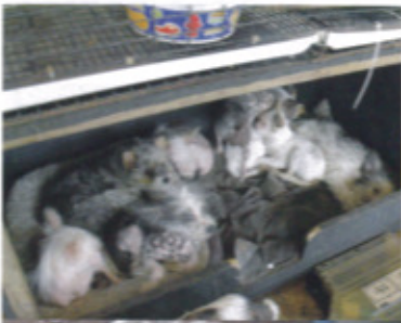
At the Scene