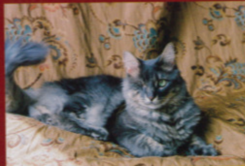
Feline Consultant: Pirate