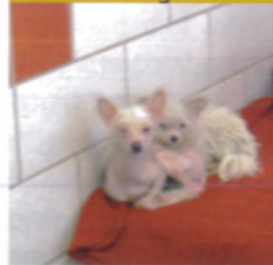
First Night at HHS

The canines, most of which were Chinese Cresteds and Chihuahuas, had completely taken over the house and backyard. The owner admitted to the officers she had begun to live out of her vehicle, abandoning the premises to the dogs. The entire residence was covered in accumulated, fetid waste. Holes had been cut in the back of the house to allow the dogs to run freely between house and yard. Each animal was safely loaded and transported to Houston Humane Society's Animal Wellness Clinic, where the real work began.