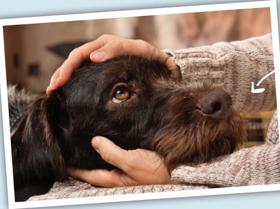
HHS Microchipped 251 pets during our July low-cost Microchipping Event in our Animal Wellness Clinic