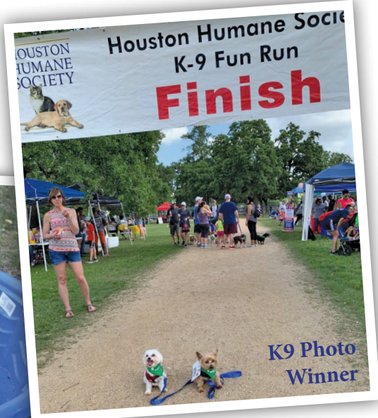
K9 Photo Winner