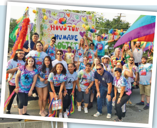
HHS was proud to participate in the 2019 Pride Festival & Parade

Hundreds of pets and their owners showed up to TC Jester Park and enjoyed a fun-filled day. Whether they participated in the competitive one-mile race or the non-competitive one-mile walk or strutted their stuff in the costume contest or alumni parade, everyone really showed up! We truly loved new attendees, seasoned participants, and former HHS residents unite in their shared love for pets. We look forward to seeing everyone back at the Fun Run next year.