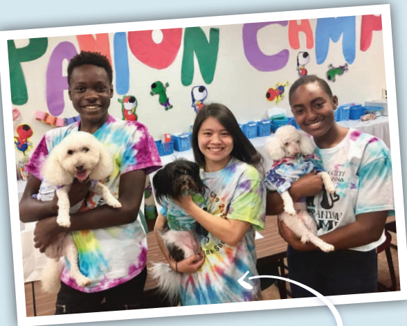
193 kids attended HHS Companion Camp this summer